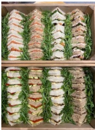
Example triangle sandwich tray