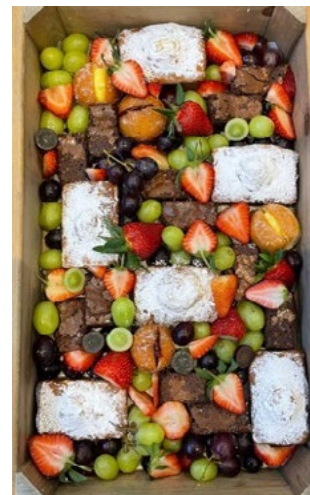
Example sweet items tray