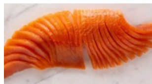
Sashimi cut salmon side