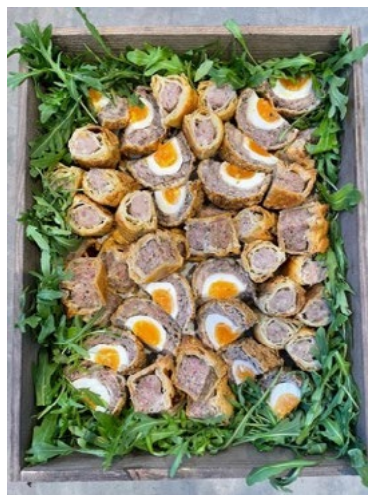
Example savory items tray