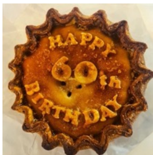
Example personalised pork pie