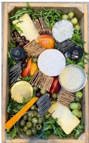
Example vegetarian deli tray